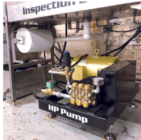
High-Pressure Pump System