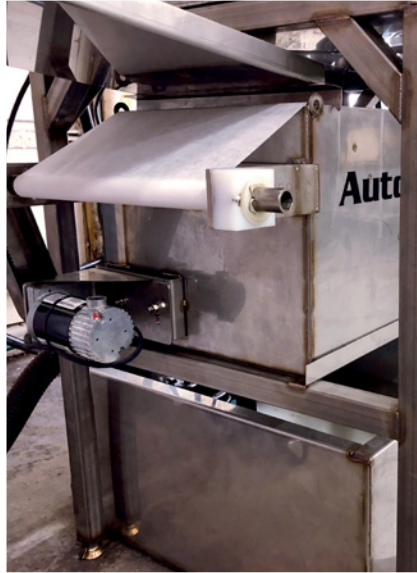
Auto Filtration System