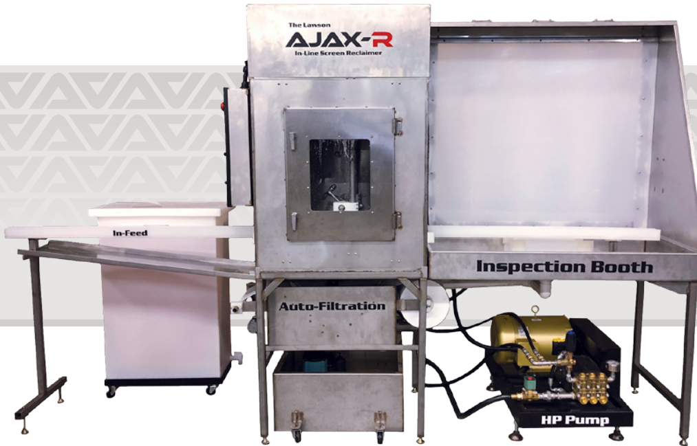
Shown with Inspection Booth